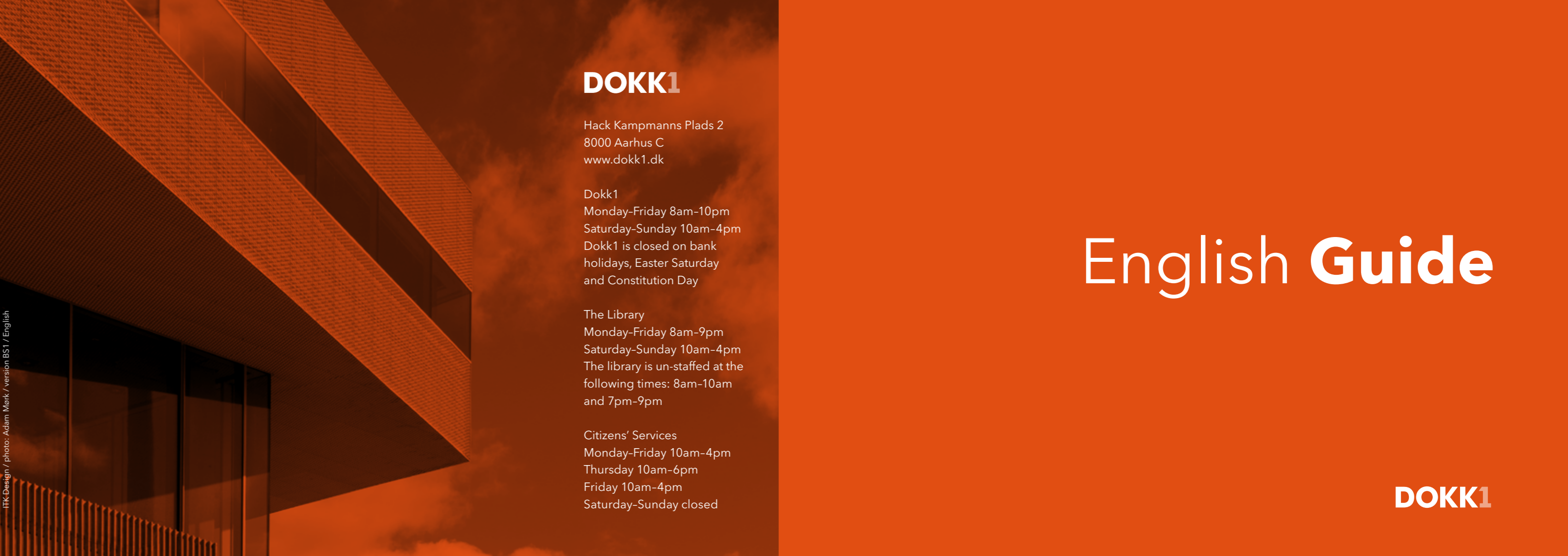
ITK-Design / photo: Adam Merik / version BS1 / English